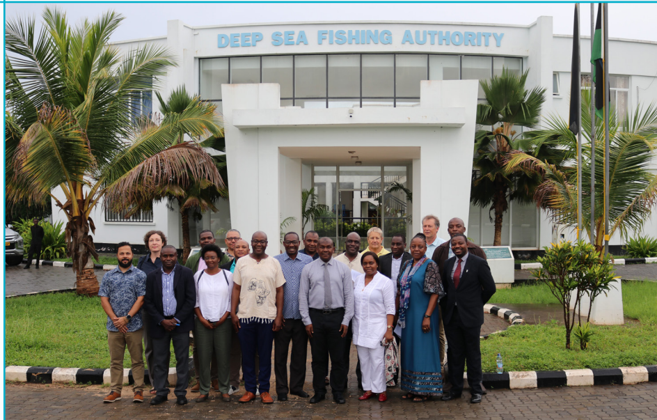
Delegates from SADC and DSFA staff posing for a group photo at DSFA Offices Fumba Zanzibar.