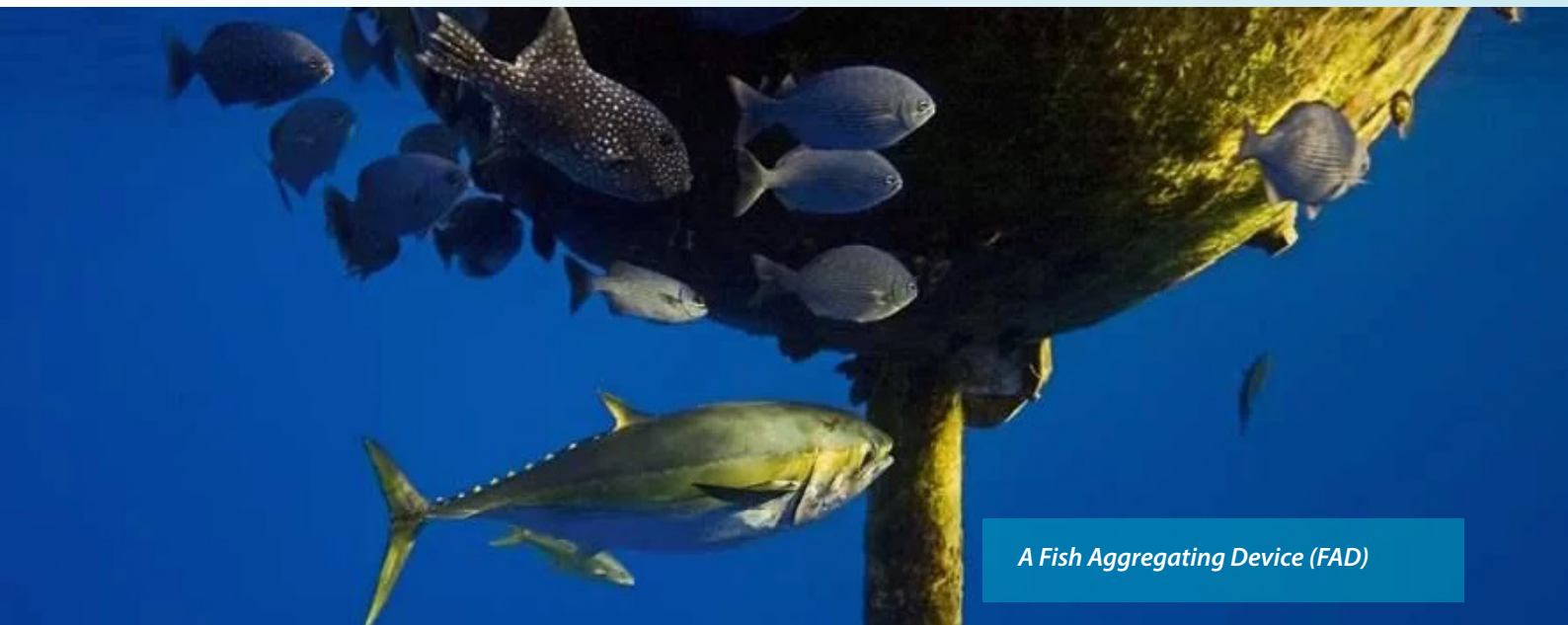
A Fish Aggregating Device (FAD)

estimations, good leadership, team working and good technical skills. It is suggested that enhancing capacity building in terms of technical skills, technology transfer, access to credits, improving vessels size and having special grant envelope to support research on priority areas will be crucial future. Finally, the fisheries sector should be increasingly formalized to improve country taxation and its contribution into GDP, and poverty reduction as a final endpoint.