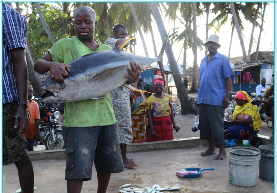
Tuna landed by small scale fishers at Kilwa Kivinje .