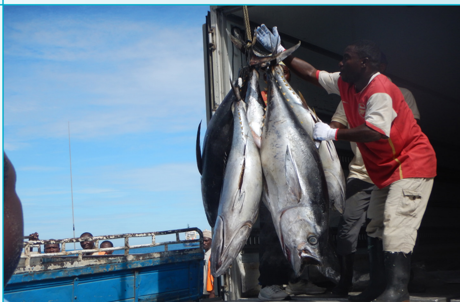
Offloading of tuna caught in Tanzanian EEZ from a private fishing vessel (Al-Maida).