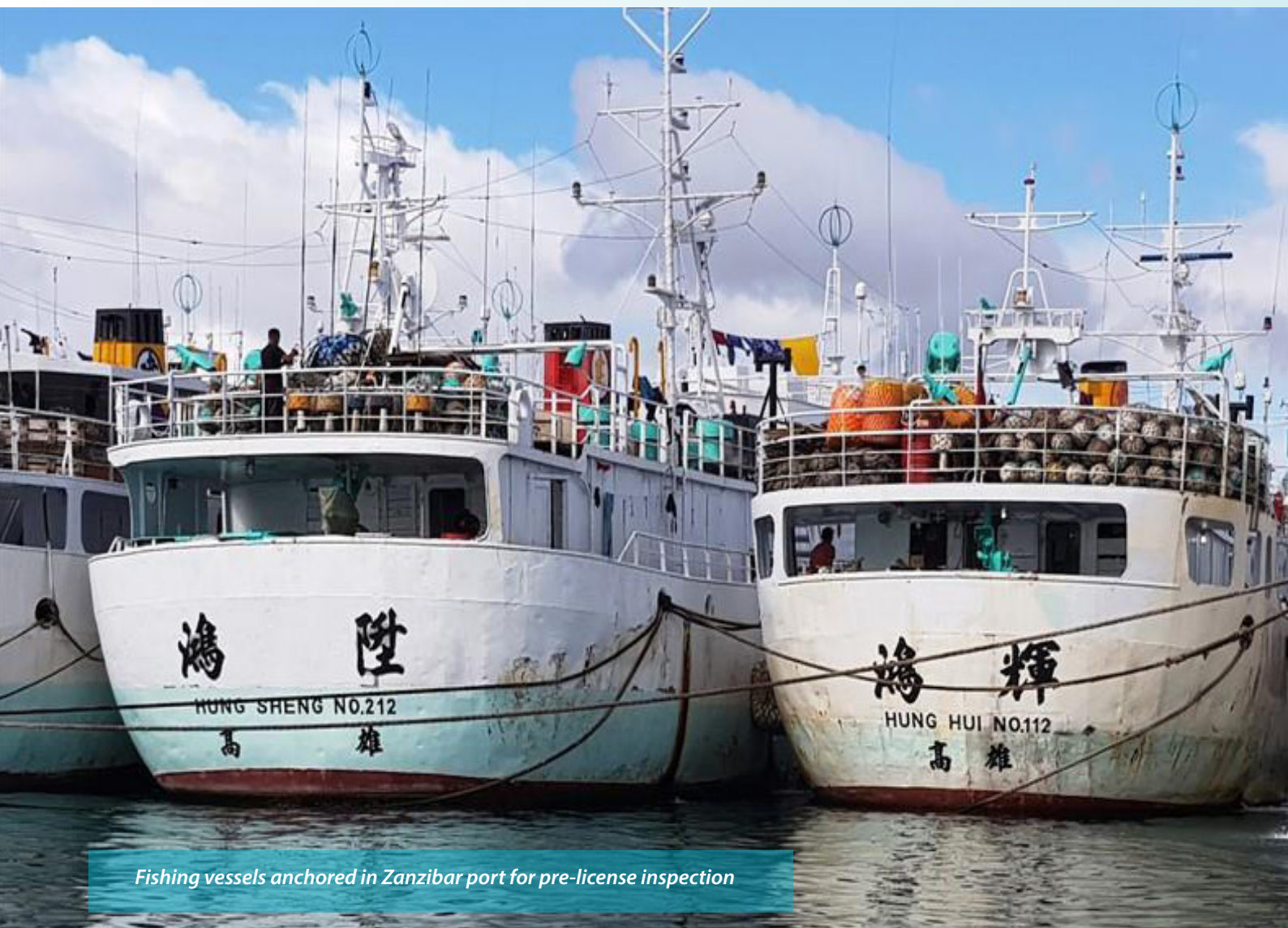
Fishing vessels anchored in Zanzibar port for pre-license inspection