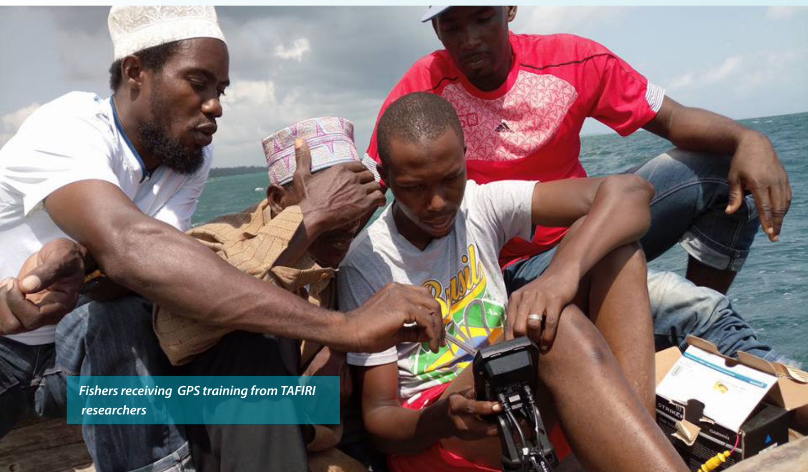
Fishers receiving GPS training from TAFIRI researchers