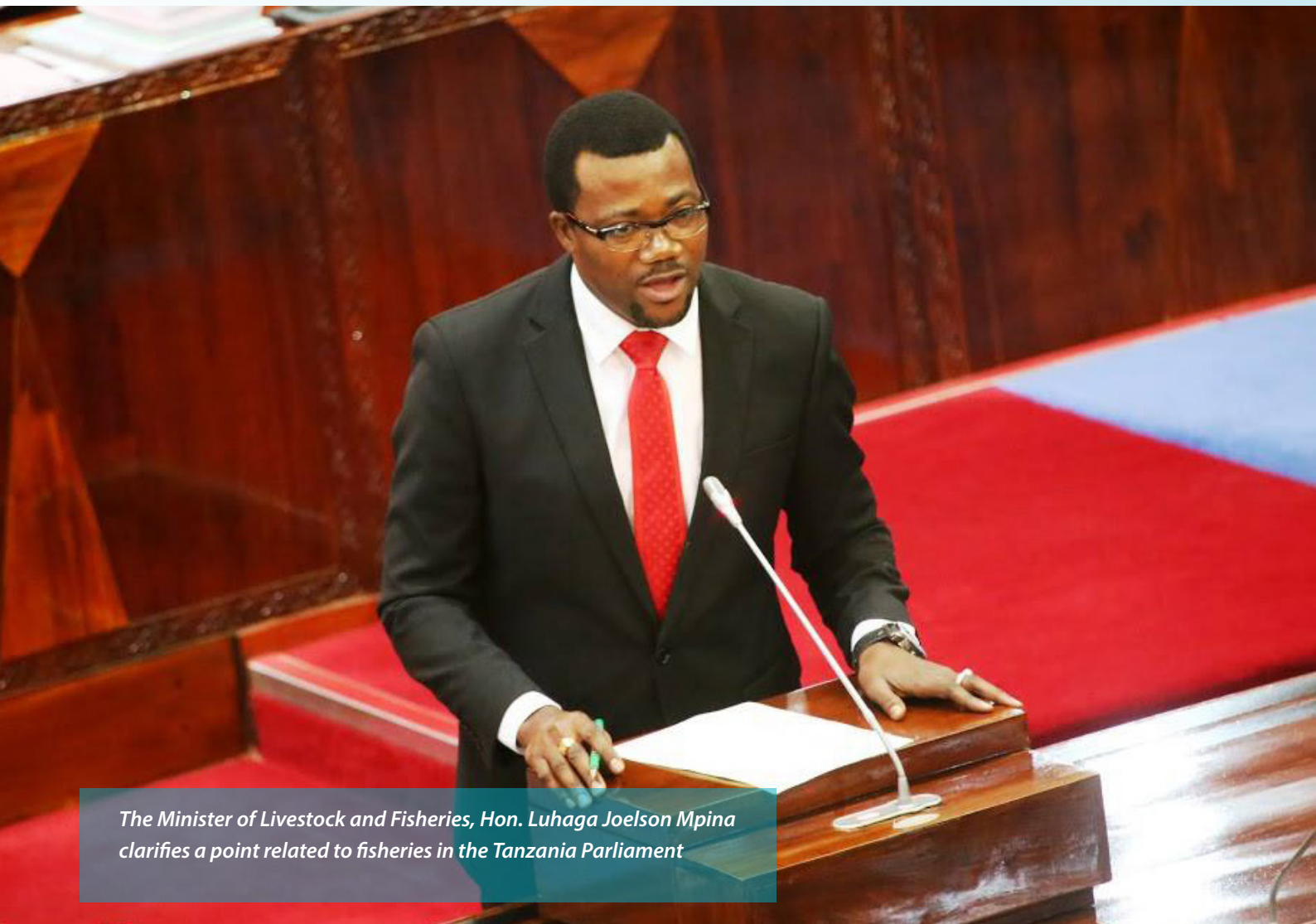
The Minister of Livestock and Fisheries, Hon. Luhaga Joelson Mpina clarifies a point related to fisheries in the Tanzania Parliament