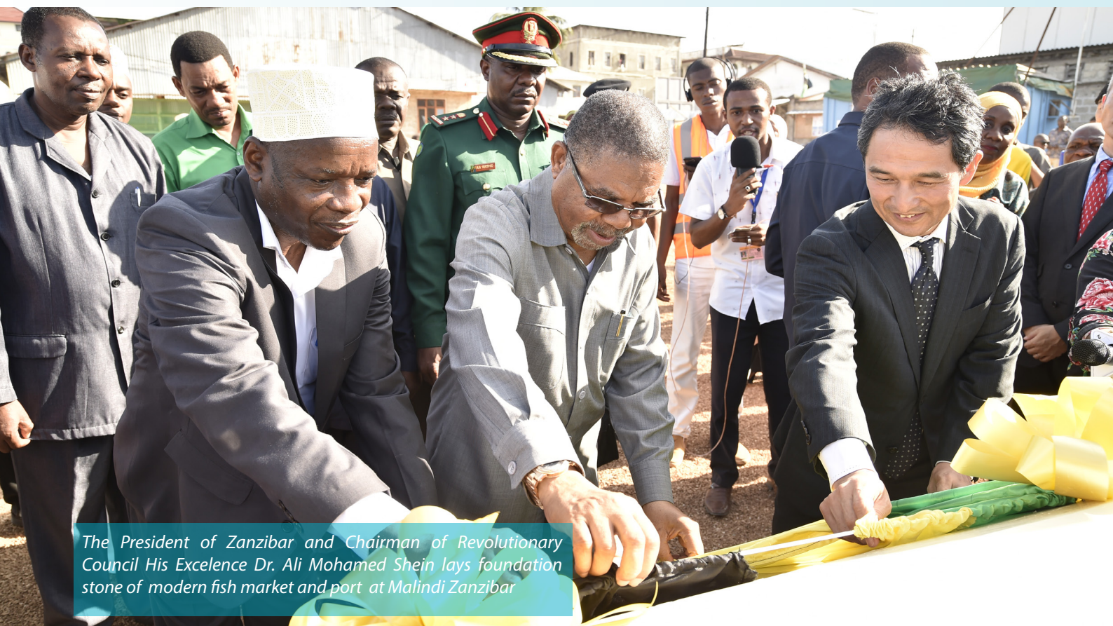
The President of Zanzibar and Chairman of Revolutionary Council His Excellence Dr. Ali Mohamed Shein lays foundation stone of modern fish market and port at Malindi Zanzibar

(MDAs) with responsibility for the management of marine resources, including tourism, marine resources, economic development and investment, environment management, maritime transport, security and offshore petroleum development.