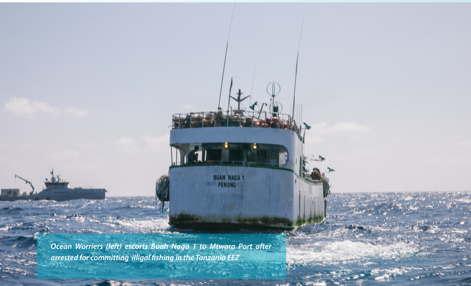
Ocean Worriers (left) escorts Buah Naga 1 to Mtwara Port after arrested for committing illegal fishing in the Tanzania EEZ