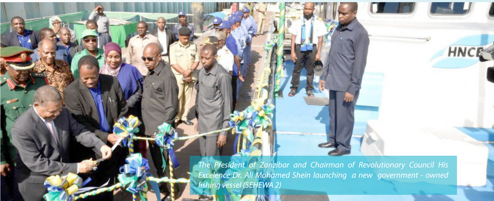
The President of Zanzibar and Chairman of Revolutionary Council His Excellence Dr. Ali Mohamed Shein launching a new government - owned fishing vessel (SEHEWA 2)