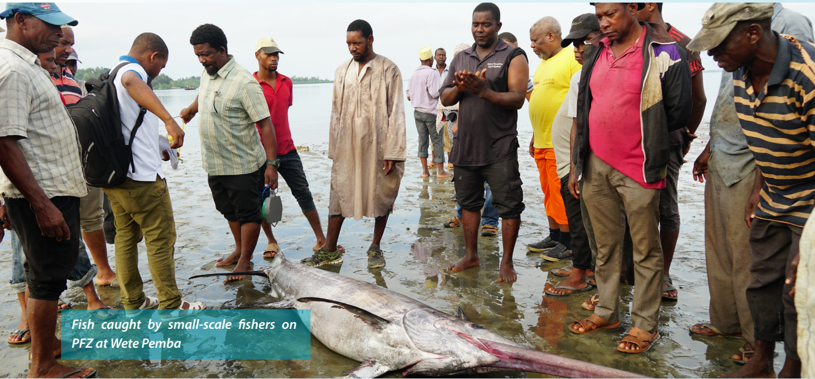
Fish caught by small-scale fishers on PFZ at Wete Pemba