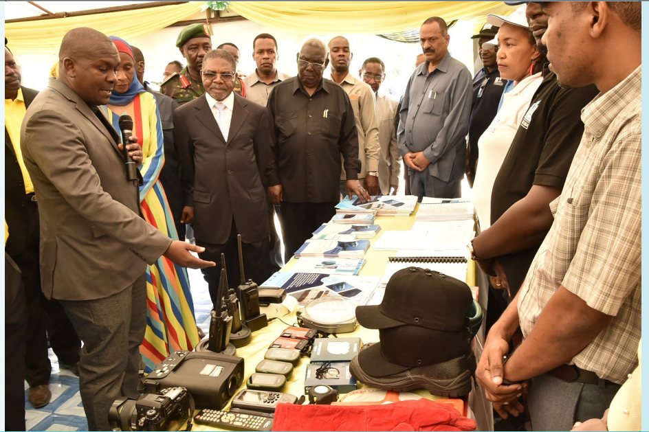
The President of Zanzibar and Chairman of Revolutionary Council His Excellence Dr. Ali Mohamed Shein receiving information from the Director General of DSFA during the Agriculture Exhibition (Nane Nane) held at Kizimbani Zanzibar in August 2019.