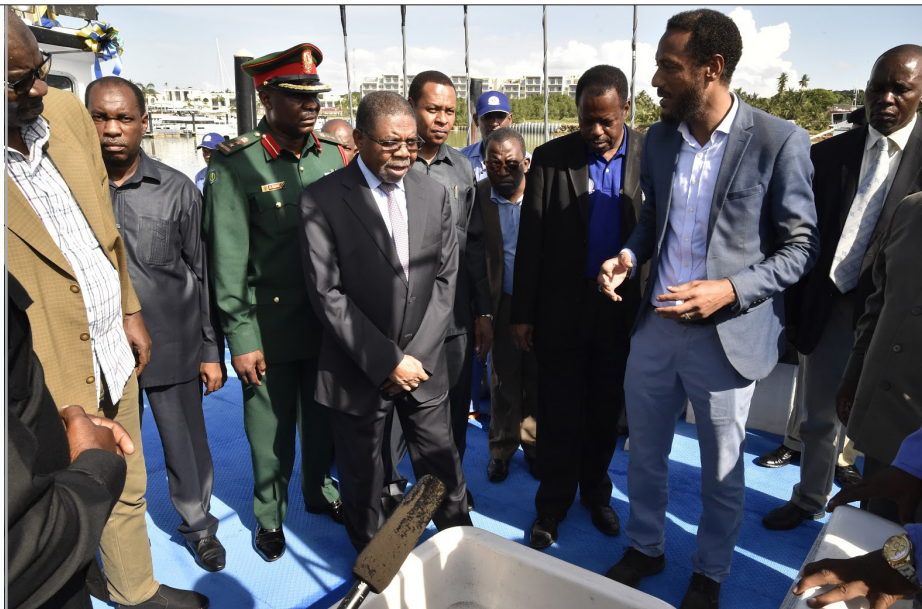
The President of Zanzibar and Chairman of Revolutionary Council His Excellence Dr. Ali Mohamed Shein receiving information from the Executive Director for ZAFICO during launching ceremony of a new fishing vessel (SEHEWA 2)